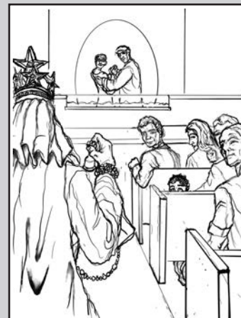
At that instant, Father entered the church.