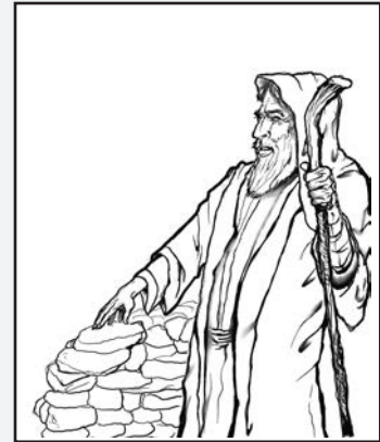
Abraham saw the coming of Jesus because he obeyed God.

How do you know when God talks to you? What are the ways that God communicates to you His plan for your life?